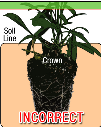
Do NOT bury the crown of the plug